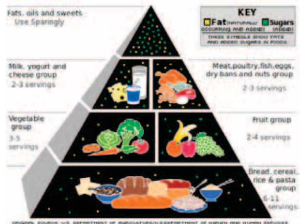
Food Guide Pyramid A Guide to daily Food Choices

One of the most important things you can do for your memory is simply to eat well. Brain cells—indeed, all body cells—need adequate nutrition for normal activity. Current dietary guidelines suggest that a varied diet that is low in fat and high in fruits, whole grains, vegetables, and protein is best. Fruits and vegetables can also be important food sources of antioxidants, food components that may provide protection from disease and aging. The U.S. Department of Agriculture's recommended dietary guidelines are a great resource for figuring out exactly what a well-balanced diet should include.